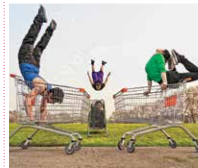
(TROLLEYS – Winner of the Argus Award for Artistic Excellence at Brighton Festival 2012)

Trolleys spin, glide and slide in this highly physical, humorous outdoor performance where contemporary dance, acrobatics and street dance merge with the extraordinary world of trolleys. Set to a pounding electro-acoustic score, TROLLEYS will tease, thrill and move its audience. You'll never go shopping in the same way again.